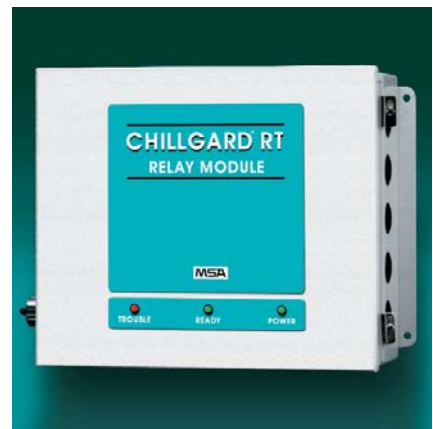
Chillgard RT Refrigerant Monitor Relay Module